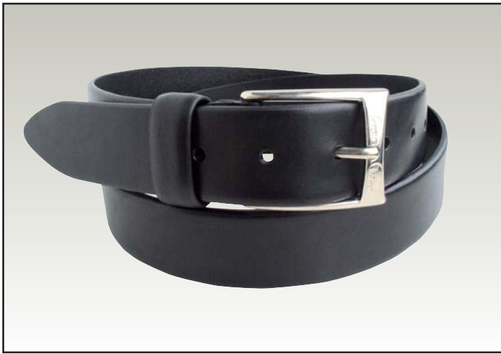
Sergio Grasso bridle Nice leather bridle, without lining.